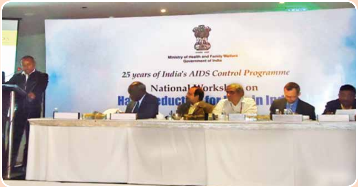
Senior officers in inaugural function attending Harm Reduction Workshop